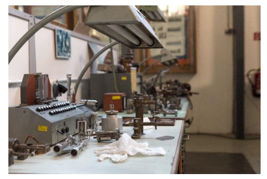
Exhibits at the Industriesalon Schöneweide © Juste Cizeika