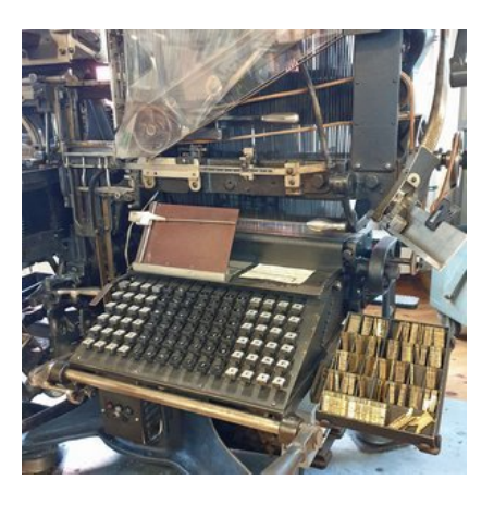
Hamburg (D). Museum of Work

ERIH Event: WORK it OUT - the dance event 2023 in figures