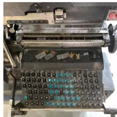
Lutsk (UA). Museum of Science and Technology