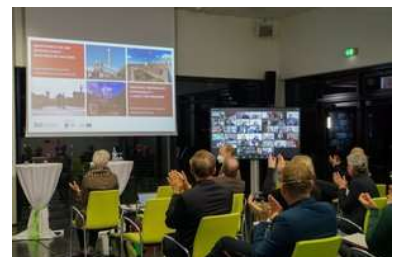
Berlin Forum on Industrial Culture 2021

"Industrial Heritage and Sustainability – New Approaches to our Legacy" was the title of the conference in cooperation with the Berlin Centre for Industrial Culture (bzi). The event was part of the "Berlin Forum for Industrial Heritage and Society", with nine editions already well-established in German-speaking Europe. This year's topic of sustainability fits neatly into the ERIH agenda for the coming years: The challenges of climate change and the call for a long-term approach to the preservation and communication of industrial heritage will be one of the priorities of the ERIH network.