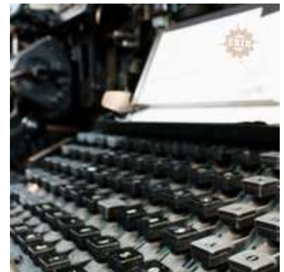
Linotype in the Stralsund Game Card Factory