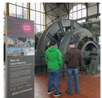
"Linking Europe" display next to winding engine, Zollern II/IV Colliery LWL Industrial Museum, Dortmund (D)

One of the most important projects in this regard is the virtual exhibition "Linking Europe", which went online in September 2019. It links ERIH sites with each other and thus highlights European correlations. This is done either by means of individual objects or in relation to historic industrial aspects such as transnational transfer of technology. To ensure that the exhibition continues to grow, we cordially invite sites interested in participating to submit their own Linking Europe proposals. In addition to the virtual presentation, ERIH members benefit from a production cost subsidy totalling up to €250 for an individualized roll-up display or a banner that can be used, for example, to indicate the European references of a particular machine or a special architectural feature. The chart is provided by ERIH as a ready-to-print pdf.